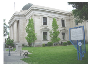
Virginia Street at the Washoe County Courthouse -- Reno