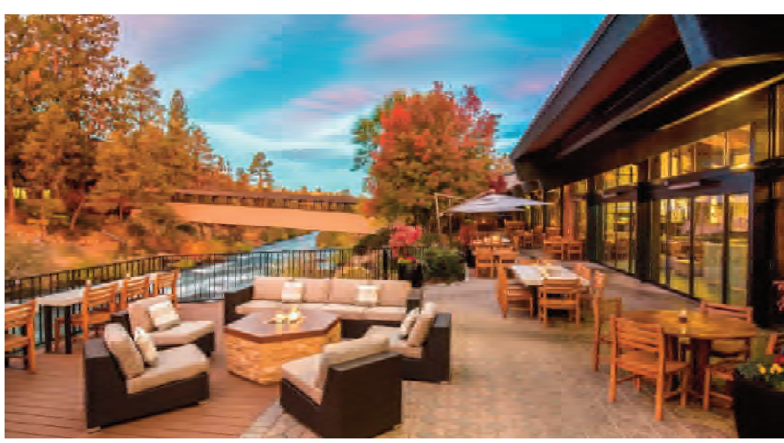
New venue this year at the Riverhouse on the Deschutes in Bend, Ore.

ACBL members, $13; lapsed members, $17; under age 26, $6. Temporary memberships available at venue.